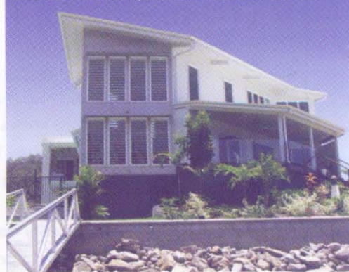
2009 HIA-CSR NORTH QUEENSLAND HOME OF THE YEAR